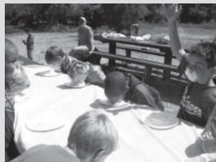
Children enjoying a game at the campout last summer.