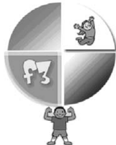
Fostering Faster Follow-up

Medicine is only given to the child for whom it was prescribed. You should